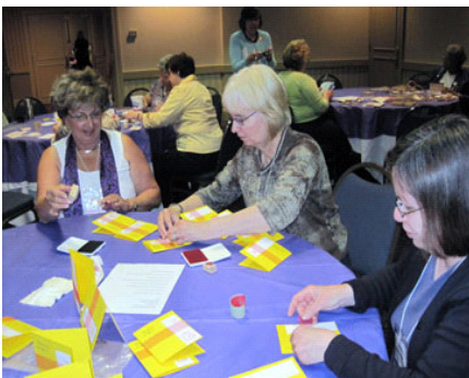
Convention goes designing greetings cards to be used at the Lutheran Home of Livonia. It was reported that residents had loads of fun looking at the cards and thought they were as good as those sold by Hallmark.