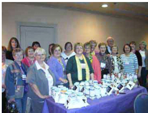
Attendees involved in servant events. On the left, a team poses with the dry soup and muffin mixes in Mason jars they assembled. On the right, another group puts together health kits. Both projects resulted in Gifts from the Heart for Lutheran City Ministries, Inc. of Detroit.