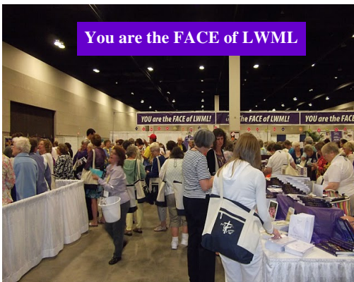
LWML Peoria Convention