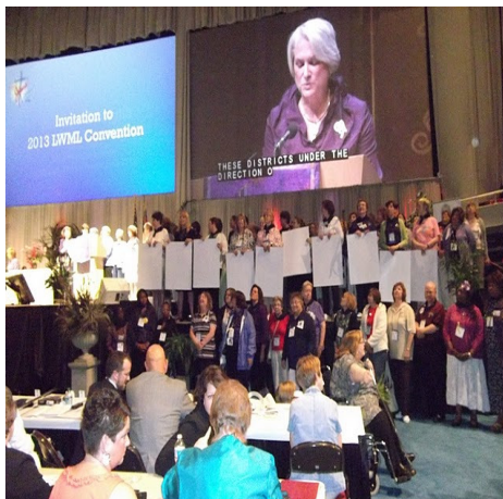
Invitation to 2013 LWML Convention